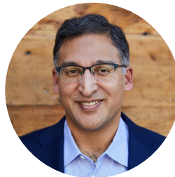
Neal Katyal Former U.S. Solicitor General