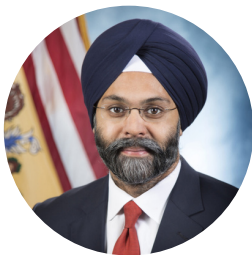
Gurbir Grewal Director of Enforcement, U.S. Securities and Exchange Commission