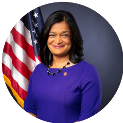
Rep. Pramila Jayapal Member of the U.S. House of Representatives