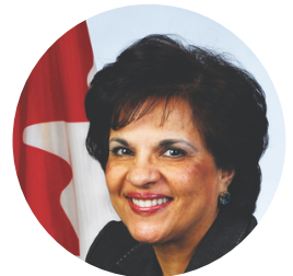
Sen. Mobina Jaffer Canadian Senator from British Columbia