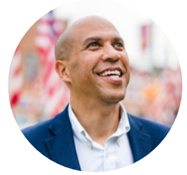
Sen. Cory Booker U.S. Senator from New Jersey