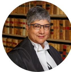
Hon. Ritu Khullar Justice, Court of Appeals of Alberta