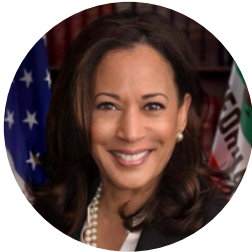
Kamala Harris Vice President of the United States