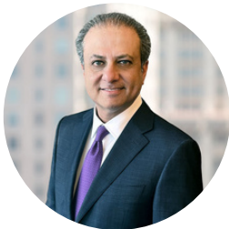
Preet Bharara Former U.S. Attorney General for the Southern District of New York, Partner, WilmerHale, Professor, NYU Law, Author and Podcaster