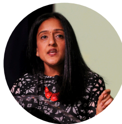
Vanita Gupta U.S. Associate Attorney General