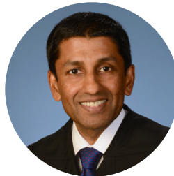
Hon. Sri Srinivasan Chief Judge, U.S. Court of Appeals for the District of Columbia Circuit