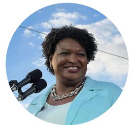
Stacey Abrams Former Minority Leader of the Georgia House of Representatives Founder, Fair Fight for Georgia